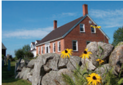
Twelve acres of orchard surround our 1790 colonial bed and breakfast near Lake Winnepesaukee.

Musicians are invited to play our piano or Hammond at impromptu gatherings. Take a book and a lawn chair and read by our pond surrounded by the burst of autumn foliage. Relax with a cool drink on our porch while you watch the sun set behind Red Hill. Sip a warm cocoa by the fire. Whatever the season, look up to a night sky full of stars. The quiet of the country and warm hospitality are always included.