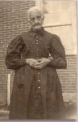
Moultonborough Historical Society

bricks for the much needed addition were crafted by their son from clay found at the stream that now bounds the property. The homestead stayed in the Brown family for over 150 years — until the middle of the twentieth century.